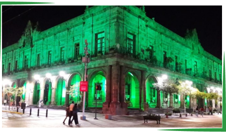
Government Building in the city of Guadalajara, capital of the state of Jalisco