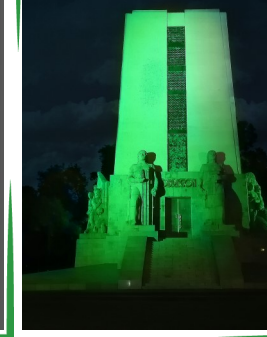
Mexico's Independence Monument