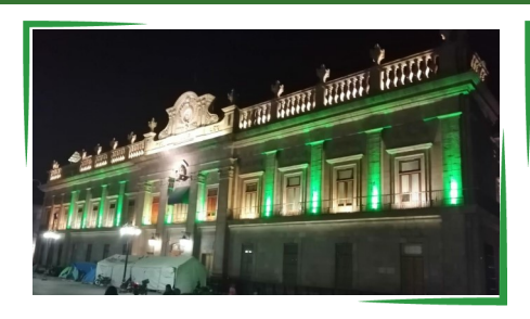
Government Building in the city of San Luis Potosí, capital of the state of San Luis Potosí