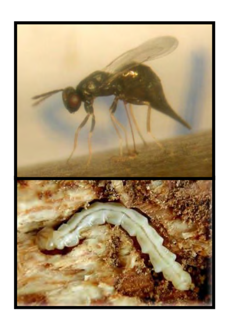
EAB / Tetrastichus planipennisi