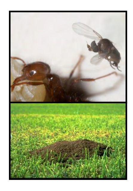
IFA / Phorid Flies