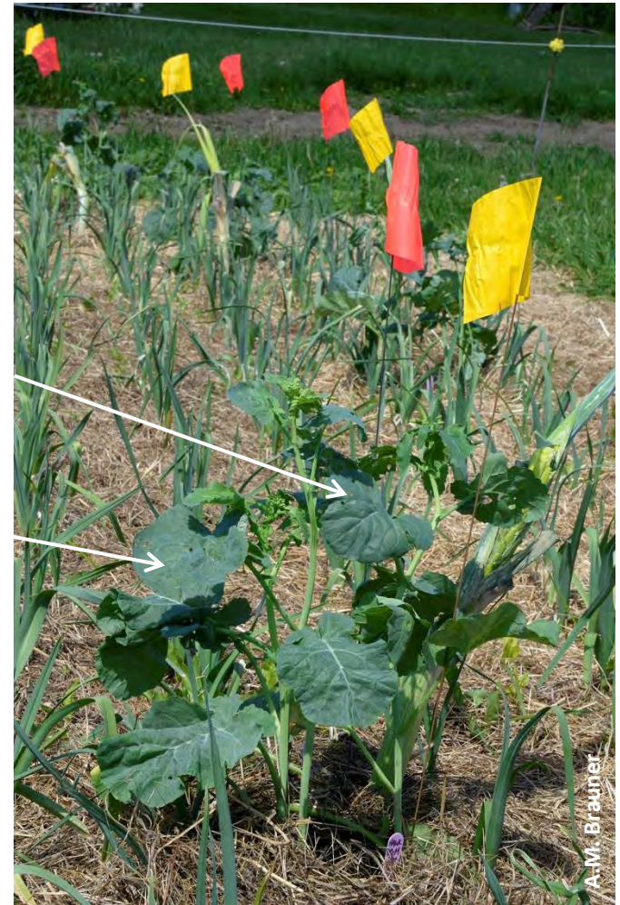
Non-target host plant