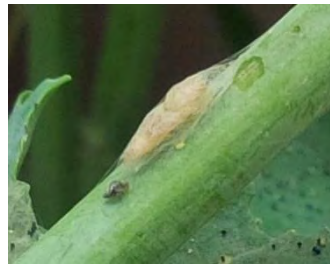
Non-target host pupa

Diamondback moth, Plutella xylostella (L.), which is known to be a suitable host for D. pulchellus , will be set out on sentinel plants in close proximity to and at various distances away from the release location. These sentinel diamondback moth pupae will be sampled at the same time that leek moth pupae are sampled.