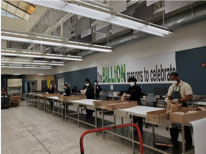
PPQ's Miami Plant Inspection Station utilizes white inspection paper to maintain a 6-foot social distancing buffer between inspectors.

In Canada, inspectors involved in various plant health activities such as surveillance, wear face mask and/or practice physical distancing to reduce health risks associated with COVID-19.