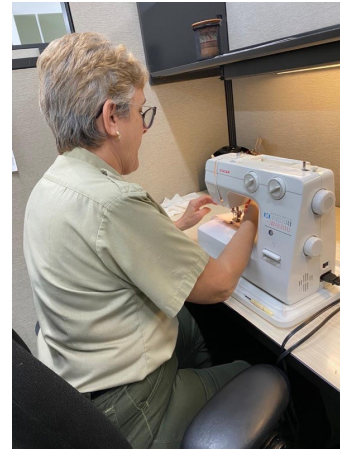
A PPQ employee brings a sewing machine to PPQ's Miami Plant Inspection Station to make masks for the entire staff.

In the United States, employees have pitched in to help keep plant health operations going. For example at the Miami, Florida, plant inspection station, an employee brought in a sewing machine to make masks for the entire staff. At airports in Hawaii and Puerto Rico, PPQ installed acrylic barriers to protect our inspectors during agricultural inspections of passenger