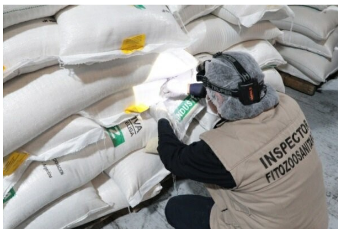
Almost 1200 sanitary officers work at main ports, air-ports, and border points in Mexico.

Regarding preclearance of plant products in exporting countries, due to the limitations of international travel which do not allow Mexican personnel (official or approved) to travel, Mexico has decided to accept equivalent measures to preclearance (during the pandemic) relying on personnel of the NPPO's in the exporting countries for the inspection of plant products.