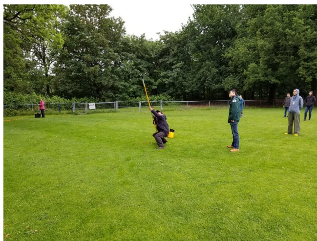
CFIA Inspectors conducting surveillance activities wearing face masks or practicing social distancing