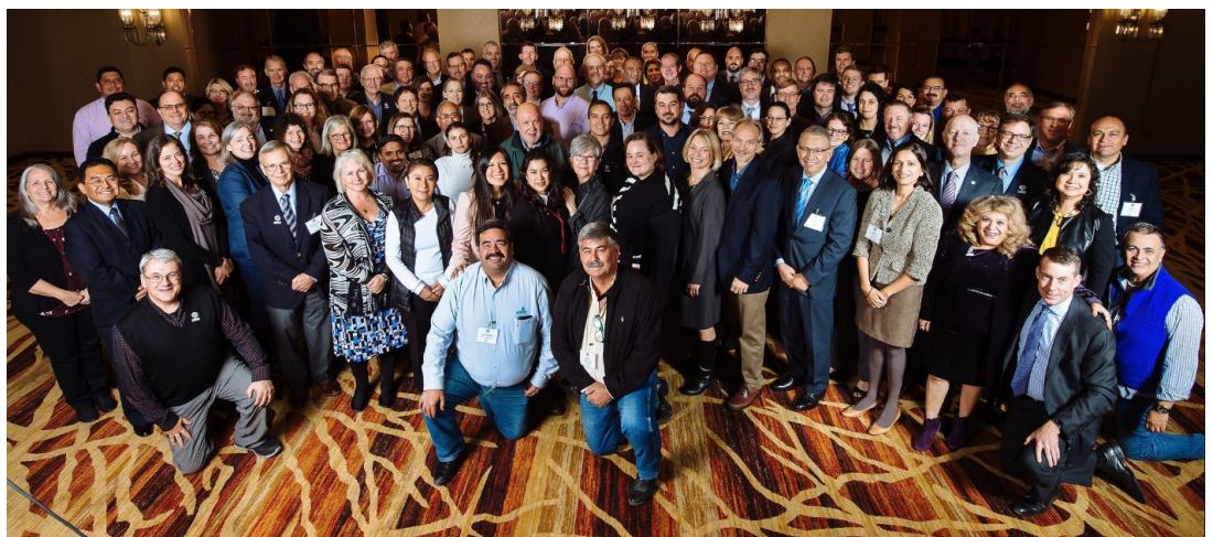
Participants of the 43rd NAPPO annual meeting in Montreal, Québec, Canada- October 28-31, 2019

NAPPO Management recognized that the uncertain travel conditions and other health and safety concerns significantly impacting plant health related activities during the COVID-19 pandemic would most certainly negatively impact attendance to the 44 th NAPPO Annual Meeting. As such, and out of an abundance of caution, they