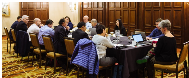
Members of the NAPPO management team (Advisory and Management Committee, Industry Advisory Group and the NAPPO Executive Committee) in a face-to-face meeting in Montreal, Canada.