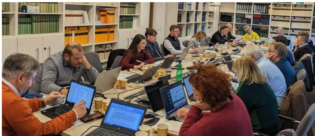
Participants of the NAPPO-EPPO meeting at the EPPO Headquarters in Paris, France

The group agreed to reconvene in Rome on the Sunday before the 17 th Commission on Phytosanitary Measures (CPM-17) meeting in late March to examine and share CPM-17 regional positions. The January 2024 EPPO-NAPPO meeting will be hosted by NAPPO and held somewhere in the United States. In addition to strategic topics, the 2024 meeting hopes to include a technical issues section, where NPPO experts from both regions can come together and address specific technical issues identified by the regions.