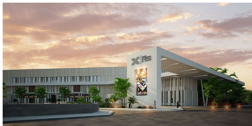
Merida International Convention Center