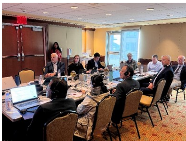
Members of the NAPPO Management Team (EC, AMC, IAG and Secretariat) meeting in San Diego, California.