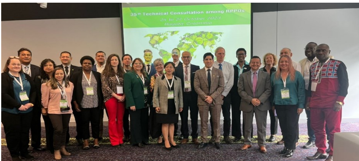
Participants at the 35th TC-RPPO meeting in Bogotá, Colombia.

For more information, please click here .