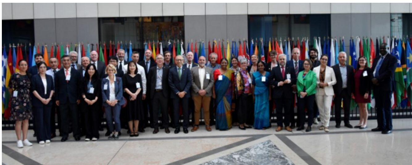
Participants at the IPPC CPM SPG in the IPPC headquarters in Rome, Italy.

Prior to the SPG meeting, some members of the NAPPO Executive Committee alongside the NAPPO Executive Director met with their counterparts from EPPO (European and Mediterranean Plant Protection Organization) to compare and harmonize positions on key issues that would be discussed at the SPG.