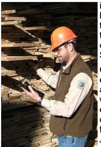
Last year, PPQ issued more than 738,625 certificates to support U.S. agricultural exports valued at more than $138 billion.

"Shipments that are detained can be released in minutes rather than days, eliminating the need to pay costly port charges," Dellis said. "ePhytos will also result in quicker and clearer communications, helping to eliminate costs that can arise from documentation errors, misunderstandings, and disputes."