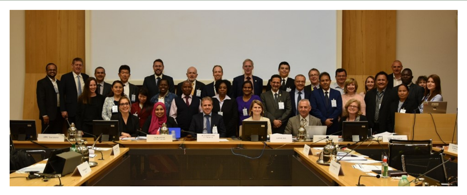
Standards Committee meeting participants.