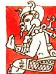
Dios C. Divinidad de la faz ornamentada