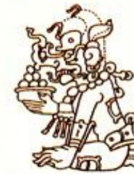
Dios K. Divinidad de la nariz ornamentada