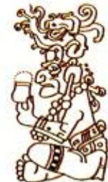
Dios D. Dios de la noche