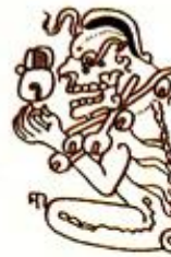
Dios A. Divinidad de la muerte