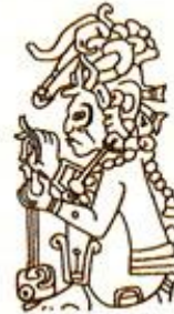
Dios F. Dios de la guerra