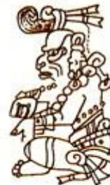
Dios G. Divinidad solar