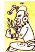
Dios N. Divinidad del final del año