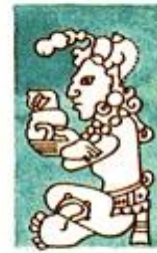
Dios H. Divinidad joven