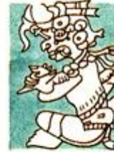
Dios B. Divinidad de la vida